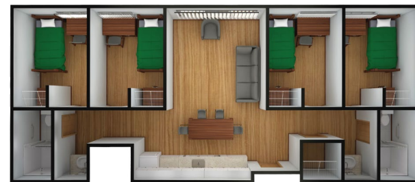
4 Bedroom 2 Bathroom Apartment (Kitchenette)

Disclaimer: These are artistic renderings and do not depict the final room designs.