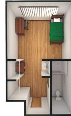
Super Single Suite