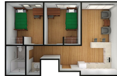
2 Bedroom 1 Bathroom Apartment (Kitchenette)